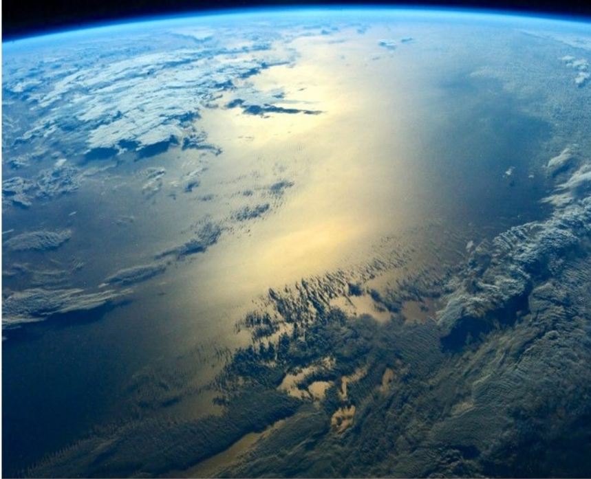
Scott Kelly 7 April 2020 from the International Space Station

Seen from space, the earth has no borders. We are all seeing now just how interconnected we are.'